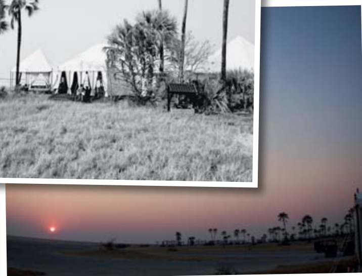
On safari with Ralph Bousfield, from Uncharted Africa.

“Change is growth and anything not growing is either paralysed or it’s not alive, because that’s life; we always change and we grow”